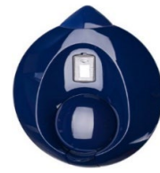
Filter Status Display